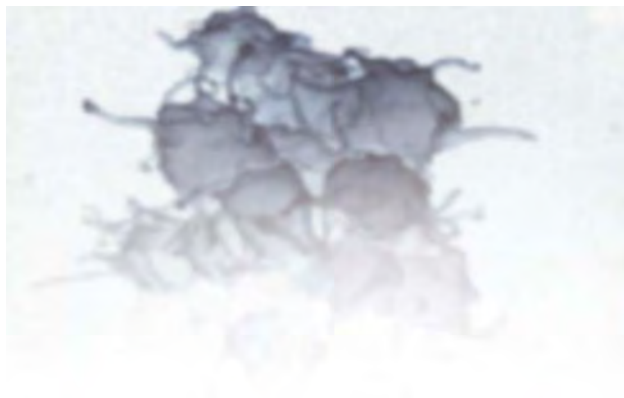
Fig. 2 Active platelets

TGFbeta is active during inflammation, and influences the regulation of cellular migration and proliferation; stimulate cell replication, and fibronectin binding interactions [23] (Fig. 2). VEGF is produced at its highest levels only after the inflammatory phase, and is a potent stimulator of angiogenesis. Anitua et al. showed that in vitro VEGF and Hepatocyte Growth Factor (HGF) considerably increased following exposure to the pool of released growth factors; suggesting they accelerate tendon cell proliferation and stimulate type I collagen synthesis [11]. PDGF is produced following tendon damage and helps stimulate the production of other growth factors and has roles in tissue remodeling. PDGF promotes mesenchymal stem cell replication, osteoid production, endothelial cell replication, and collagen synthesis. It is likely the first growth factor present in a wound and starts connective tissue healing by promoting collagen and protein synthesis [7]. However, a recent animal study by Ranly et al. suggests that PDGF may actually inhibit bone growth [24].