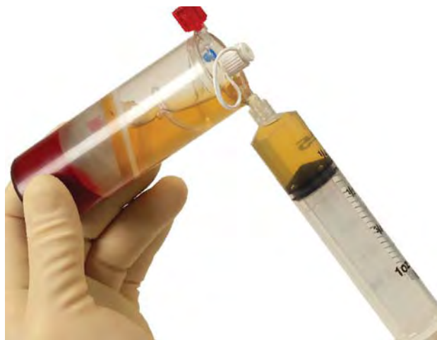
Fig. 4 GPS III system, withdrawing of platelet poor plasma to be discarded

aseptic technique from the antecubital vein. An 18 or 19 g butterfly needle is advised, in efforts of avoiding irritation and trauma to the platelets which are in a resting state. The blood is then placed in an FDA approved device and centrifuged for 15 min at 3,200 rpm (Fig. 3). Afterward, the blood is separated into platelet poor plasma (PPP), RBC, and PRP. Next the PPP is extracted through a special port and discarded from the device (Fig. 4). While the PRP is in a vacuumed space, the device is shaken for 30 s to re-suspend the platelets. Afterwards the PRP is withdrawn (Fig. 5). Depending on the initial blood draw, there is approximately 3 or 6 cc of PRP available.