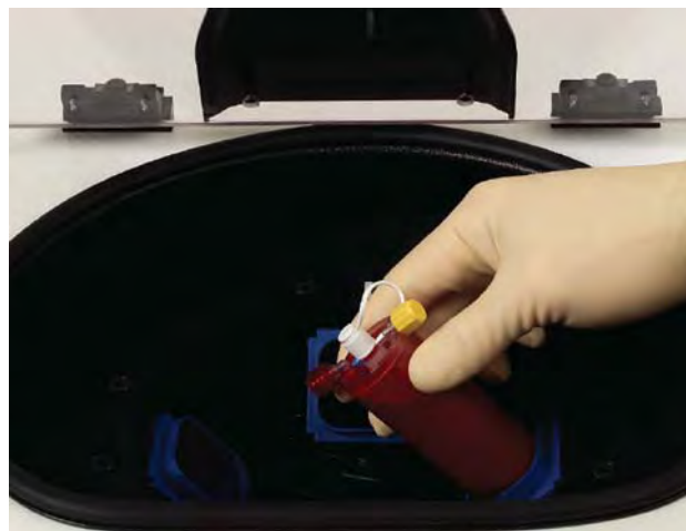
Fig. 3 GPS III system and centrifuge

Various blood separation devices have differing preparation steps essentially accomplishing similar goals. The Biomet Biologics GPS III system is described here for simplicity. About 30–60 ml of venous blood is drawn with