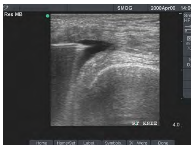
Fig. 7 Ultrasound guided suprapatella bursa injection/graft

Barett et al. enrolled nine patients in a pilot study to evaluate PRP injections with plantar fasciitis. Patients met the criteria if they were willing to avoid conservative treatments including bracing, NSAIDS, and avoidance of a cortisone injection for 90 days prior. All patients demonstrated hypoechoic and thickened plantar fascia on ultrasound. While anesthetizing each patient with a block of the posterior tibial and sural nerve, 3 cc of autologous PRP was injected under ultrasound guidance (Fig. 7).